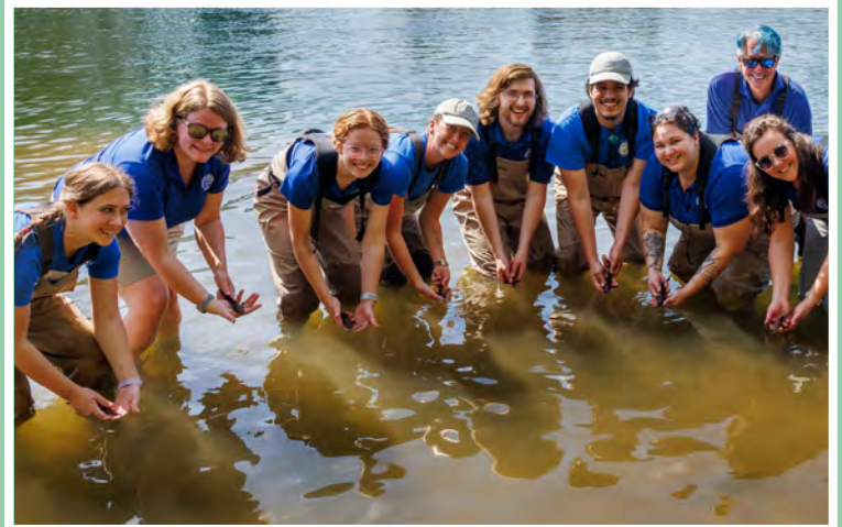
Conservation Institute staff and Fellows release Lake Sturgeon in the Tennessee River

Fellows are undergraduate students who spend 11 weeks of their summer learning alongside Aquarium staff. Many Fellows have gone on to graduate school and careers in an environmental field.