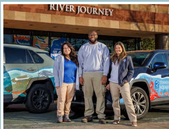
Community Engagement Educators with the Aquarium's two new education outreach vehicles