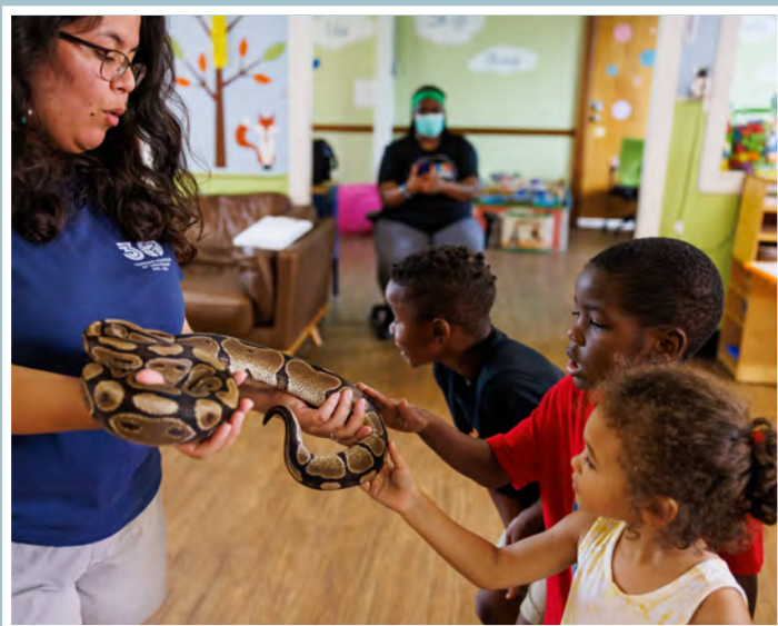
Community Engagement Educator shows an ambassador animal during an education outreach program

OUTREACH PROGRAMS 8,300 Students 71 Schools 35 Libraries 2 Learning Centers