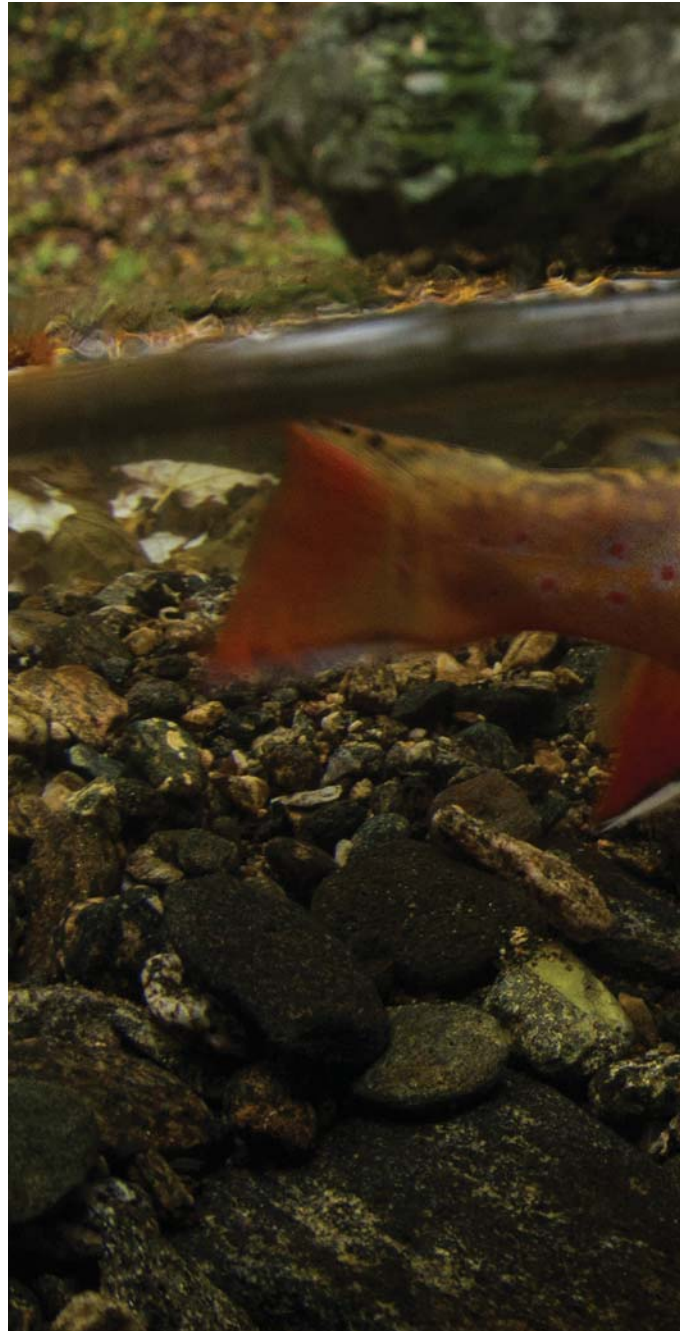
DAVID HERASIMTSCHUK © FRESHWATERS ILLUSTRATED