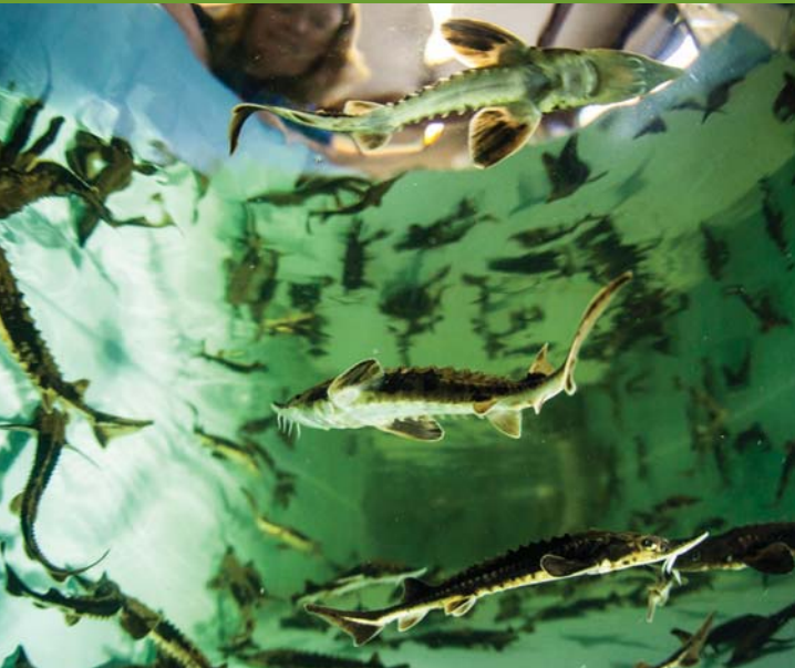
DAVID HERASIMTSCHUK © FRESHWATERS ILLUSTRATED